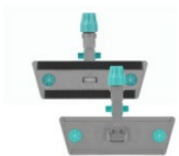
Velook frame with Block System